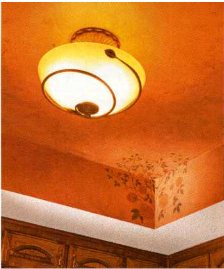
⌚ Once a flat ceiling with florescent lighting behind panels, the now recessed area was treated with plaster that was texturized, painted, and glazed. The light fixture is Venetian blown glass with a bronze metal band.