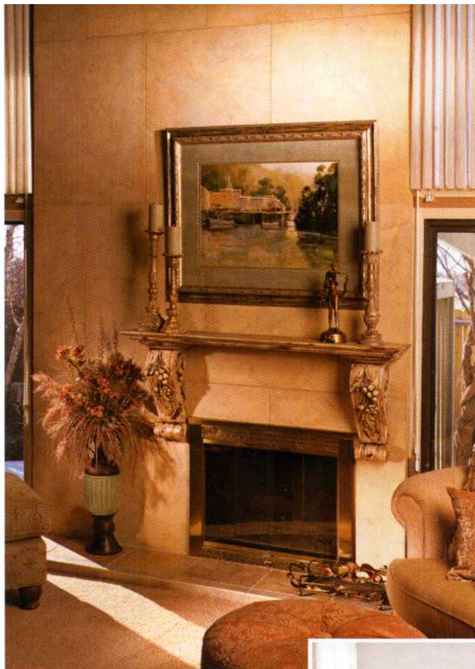
➦ The work is done. The trendy remodel adds warmth, style, and timeless beauty.

"The house had a lot of personality," she says. "It was very open, but had a dated look. The challenges were to make it as up to date as possible and to create a romantic, comfortable feel."