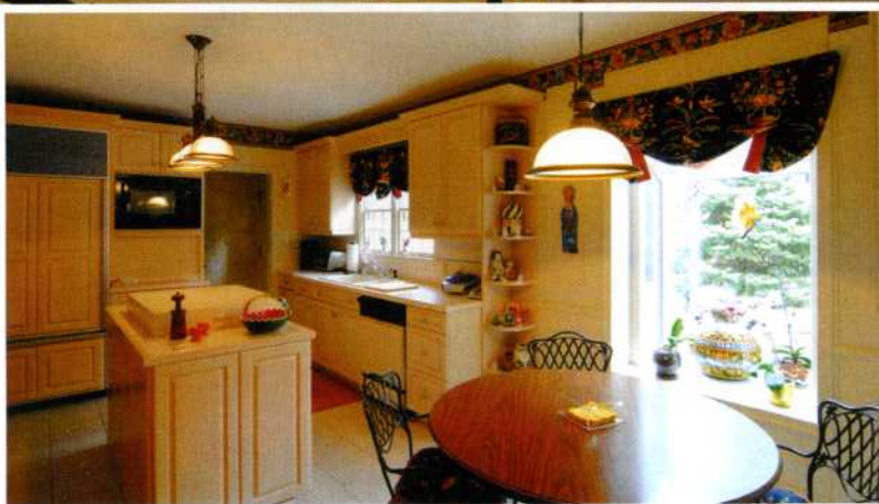
>> The home's original kitchen (left) was so small that only two people could prepare food at a time. As a result, the catering staff plated food in the garage. The new kitchen (above) is custom-made to fit the staff's needs with a professional refrigerator, a warming oven, two convection ovens and a mobile island.